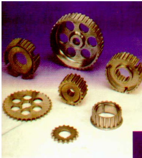
Fig.1 Powder metallurgy parts